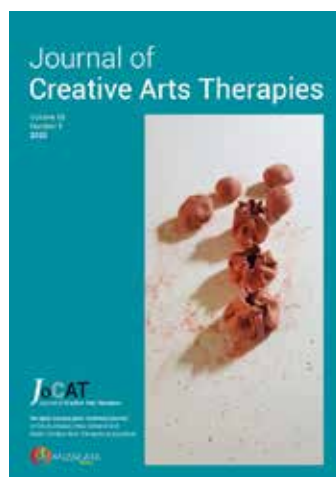
The first issue of JoCAT , from 2020. Cover artwork: Aletheia Lynne Tan, Responding Anew , 2019.