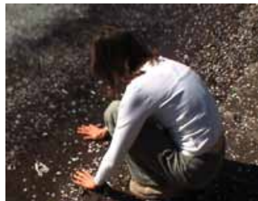
Figure 2. Versushka at the beach.

In fact Versushka did leave the house, by spontaneously climbing out of a window. She found her way to the beach, although with some difficulty. When she arrived at the beach, she responded to this environment in movement (see Figure 2). One hour and six minutes of video footage was shot by the researcher. During the editing process (with technical assistance from the researcher)