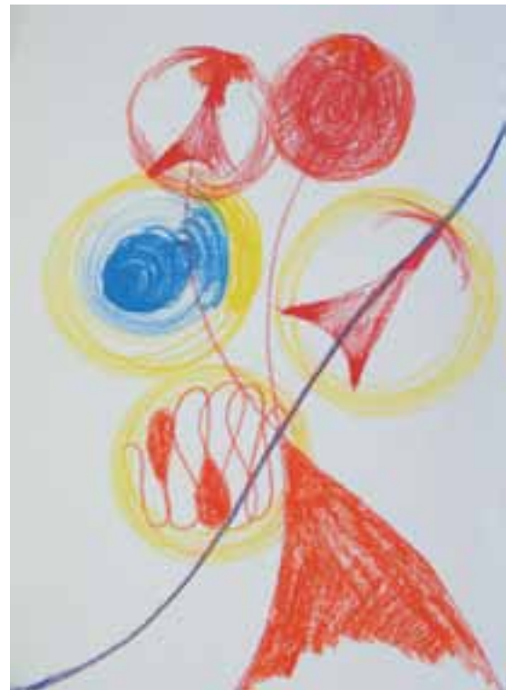
Figure 1. Drawing from the third session.

During the Halprin method sessions, Versushka explored the modalities of drawing, movement and writing. An example of the drawings can be seen in Figure 1. She identified themes and metaphors that led to a score (plan). She decided that her movement expression would begin indoors at her home, which represented safety and comfort. The next activity would be leaving this environment to embark on a walking journey to an outdoor environment, a beach nearby, which represented the unknown and 'freedom'. She was unsure if she would have the confidence to leave the known environment, and that if she did, whether she would be able to find the way to the beach. She wanted to keep these elements unplanned so that the performance of the score would reveal authentic material.