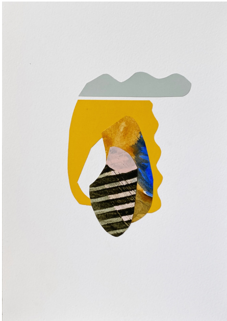
Jessie Brooks-Dowsett, Time dilates (#1,2,3,4), 2020, acrylic paint and collage pieces on paper, 297×210mm.